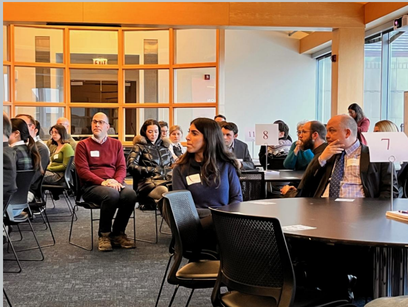
A full room of Loyola students, staff and faculty listen to an address given by Cardinal Cupich during the Synodal Gathering.